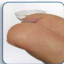
Two-Finger Method Tripod Method